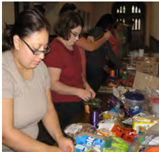
School Moms busy helping with Harvest Saturday